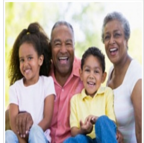
Basic steps for starting a planned giving program for your congregation.